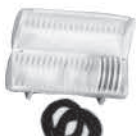
SREC FOR BARS