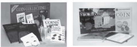
COIN COLLECTING STARTER KIT